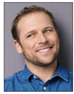
Open mouth, head tilted