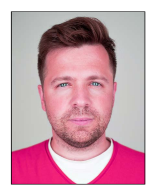
Unnatural skin tones

Note: Head coverings are only permitted for religious reasons.