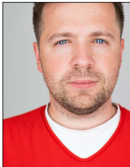
Head not shown in full