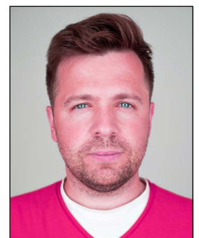
Unnatural skin tones

Note: Head coverings are only permitted for religious reasons.