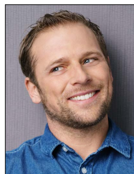
Open mouth, head tilted