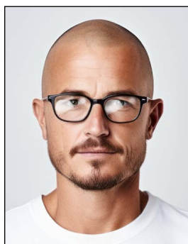
Eyes not clearly recognizable