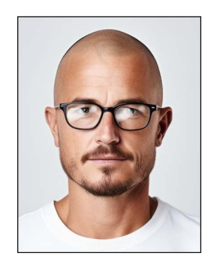
Eyes not clearly recognizable