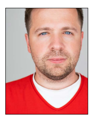
Head not shown in full