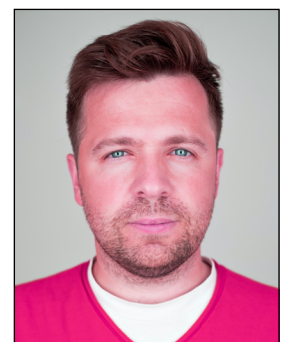
Unnatural skin tones

Note: Head coverings are only permitted for religious reasons. But: The face must always be recognizable from the lower edge of the chin to the forehead. There must be no shadows on the face.