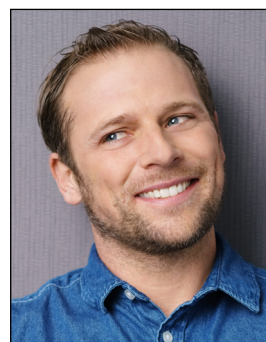
Open mouth, head tilted