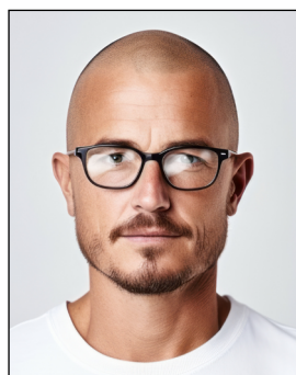
Eyes not clearly recognizable