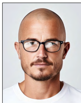
Eyes not clearly recognizable