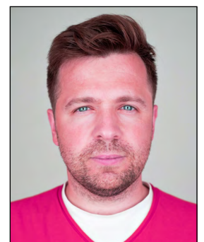
Unnatural skin tones

Note: Head coverings are only permitted for religious reasons.