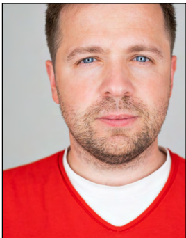
Head not shown in full